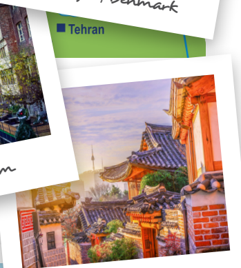
Seoul, South Korea