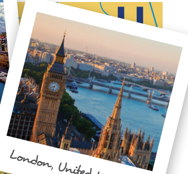
London, United Kingdom