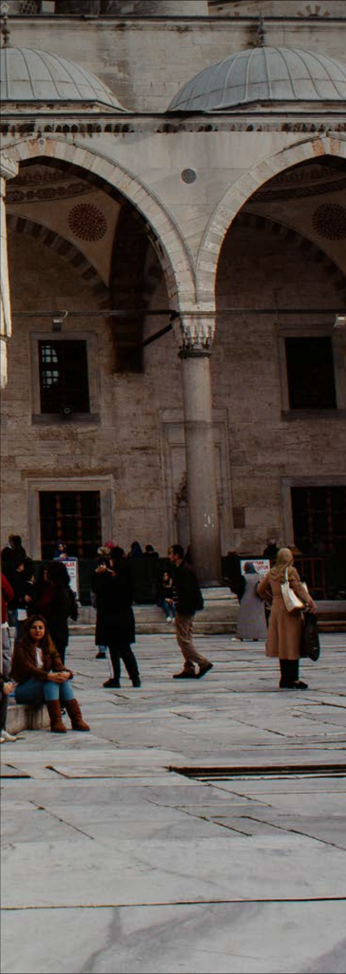
CREATIVE INDUSTRIES STUDENT JACKIE JABSON IN ISTANBUL, TURKEY.

Ryerson has identified Global Learning as its top priority for internationalization. Ryerson recognizes global learning as incorporating not only international travel, but also engagement with other cultures and nations within Canada and elsewhere. Ryerson acknowledges the roles that imperialism and colonialism have played in the oppression of Indigenous Peoples, both at home and abroad, and in shaping knowledge, learning and education generally. Global learning at Ryerson will include recognition of other ways of knowing and being that function outside the dominant Western point of view – a framework that often goes unchallenged through international exchanges or travel experiences.